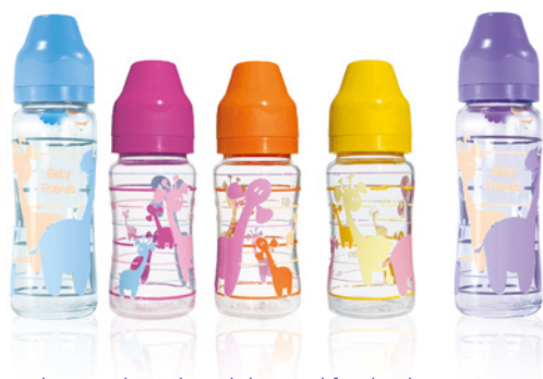
Baby Friends®, a brand designed for distributors to commercialize their baby bottles under Baby Friends® brand name.